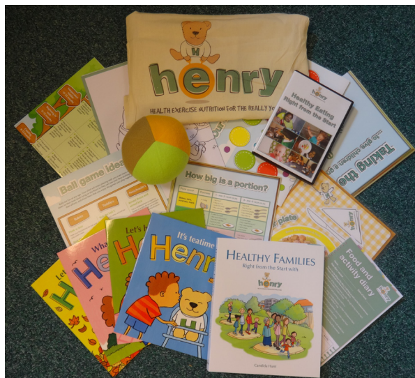
The HENRY Parent Toolkit – free to everyone joining a HENRY programme

The HENRY toolkit will help you give your child a great start in life, get the whole family involved, and keep track of how well you're doing.